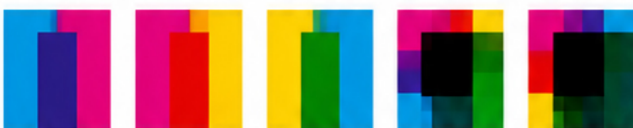
C + M

Overlapping areas should be clean and produce the expected colors without banding.